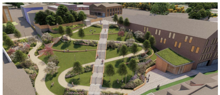
The urban park is an important part of the connectivity project for regeneration projects and developments

The contract for the build of the urban park has now been agreed and McPhillips (Wellington) Limited are on site. The project is due to be completed by Spring 2025.