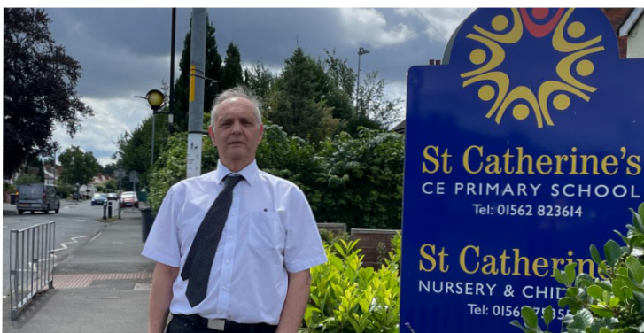
Restrictions on parking are now in place outside the primary school