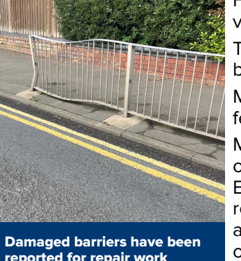
reported for repair work

Marcus continues to get contacted by local residents concerned with speeding traffic through the village. Speed enforcement is a police matter and Marcus is pleased that the location is still a speed enforcement site and the safer roads partnership speed camera van is deployed along the main A456 in the 30mph limit.