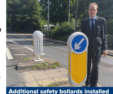
dditional safety bollards installed for the pedestrian refuge crossing

Safety verge markers and kerbing to alleviate flooding have also been installed. Potholes have