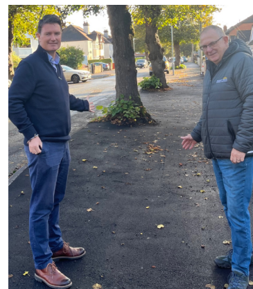
The first phase of resurfacing the pavement is completed

Your Conservative team, raised the poor condition of the pavements with Highways over 12 months ago and have delivered on their promise of getting