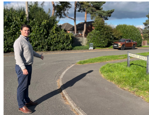
Yellow lines have been requested to prevent parking near to this junction

Cllr Desmond said “I’m grateful to local residents for raising this issue with me. I have been out to see for myself the problems and agree double yellow lines are needed. I have spoken to Highways and requested that the process be started for them to be installed”.