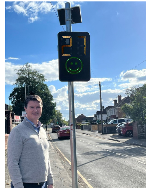
A vehicle speed activation sign has been purchased for Hoo Road