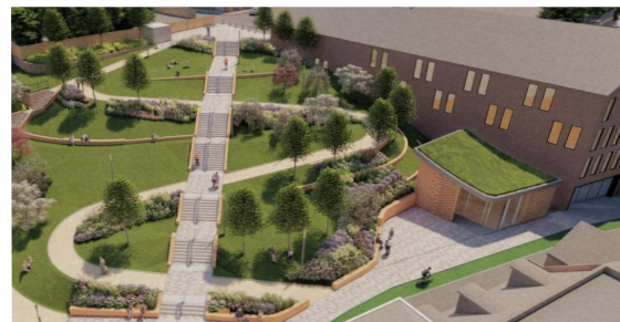
The urban park is an important part of the connectivity project for regeneration projects and developments

This is an important link from the top end of Bromsgrove Street to the town centre. It is part of the Conservative District Council's plan to regenerate the town centre.